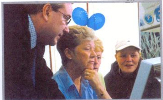
The people of Raploch get to grips with ICT.

The Worklife Adaptability Partnership is working with local authorities, colleges and universities from all across Scotland to deliver the Smart Communities Project, which is in fact an umbrella for four different projects: